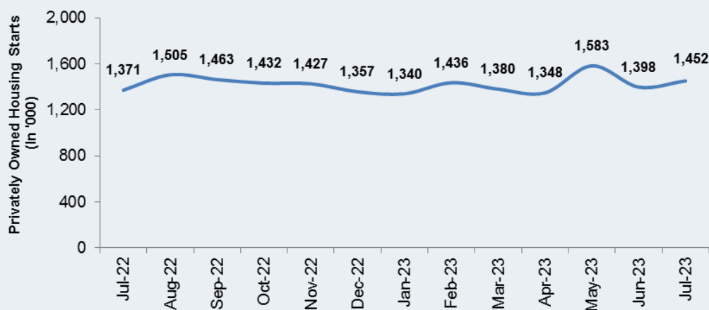
Monthly Trend of Privately Owned Housing Starts in the US, 2022-2023

One of the highlights of July 2023 is as follows: