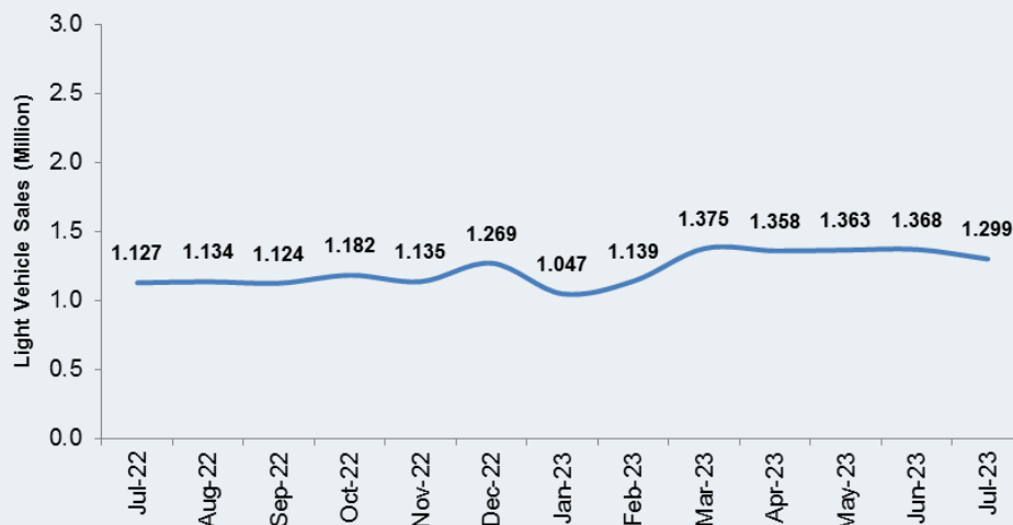
Monthly Trend of Light Vehicle Sales in the US, 2022-2023

Some of the highlights of July 2023 are as follows: